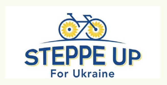
Steppe up for Ukraine - $14,601 (ongoing)