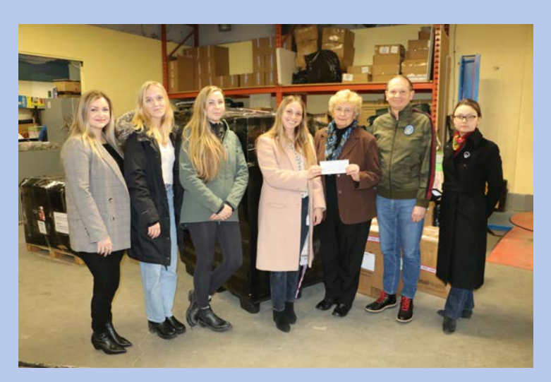
Help Us Help staff receiving cheque from BCU Foundation at Meest Corporation