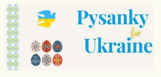
Peace Pysanky - $11,650