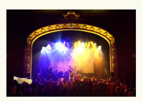
With Ukraine Fundraising Concert $26,234