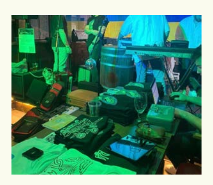
Old Sod Pub - $11,182