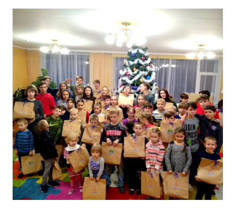
Children in residential institutions receiving their Christmas packages