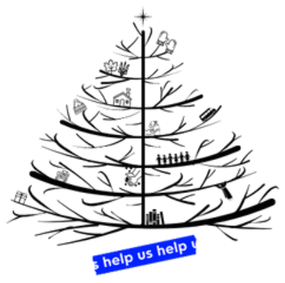
CHRISTMAS WISH CAMPAIGN

Help Us Help is grateful to its supporters and donors as well as the Help Us Help UA Staff, Scholars, and Ukrainian volunteers, who dedicated time and effort to ensure the success of these initiatives.